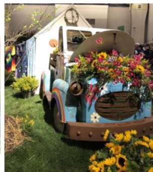
Flower Show 2019