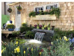
Flower Show 2019

The Philadelphia Flower Show returns in 2024 inside the Convention Center again, and we couldn't be more excited to be heading there in the new year! In 2023 we are going to celebrate the bold, the daring, the eccentric and the joyful side of flowers and gardens. The theme was inspired by that "jolt or magic we feel when we see flowers, see something captivating in landscaping or when we see something truly special". The annual Flower Show is a top destination and a must experience horticultural event! See why this yearly event attracts 250,000 visitors for a showcase of excellence that dates back to 1829.