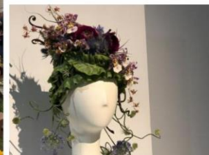
Flower Show 2019

~ Tour Package Includes ~ A fabulous trip on a Luxury Thomas Charter Motorcoach to the city of Brotherly Love, Philadelphia, hotel accommodations at Element by Westin at King of Prussia, breakfast each morning (2), Longwood Gardens, 2 half day admissions into the flower show at the convention center, guided Tour of Philadelphia with costumed guide and free time to explore Historic Philadelphia on own, and tour manager and driver gratuity. Don't delay!! To reserve your seat(s) on this outstanding trip please call us at 800-730-9091 or 413-665-9090 Email: maria@fctours.com or jessica@fctours.com We look forward to seeing you on the bus with us!