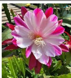
ORCHID CACTUS 'CLOWN'