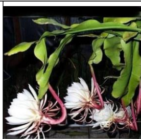
NIGHT BLOOMING CEREUS

Don't forget to check out Margaret Roach's excellent Monthly Garden