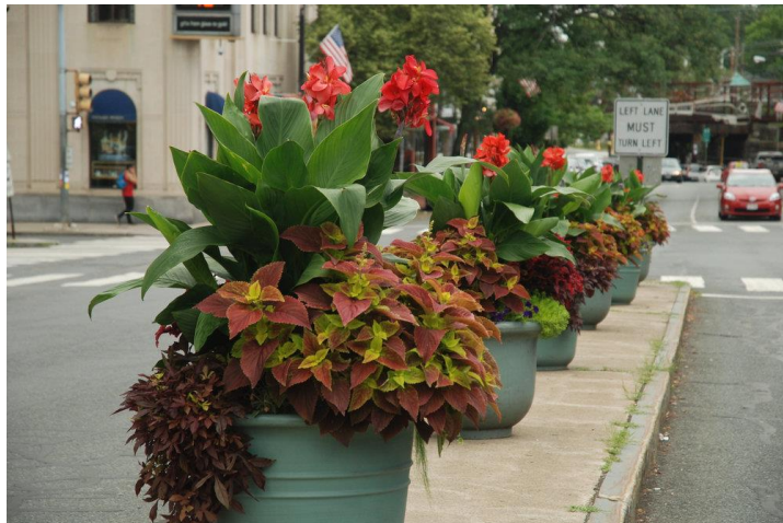
(Pictured here: Northampton, MA planters.)