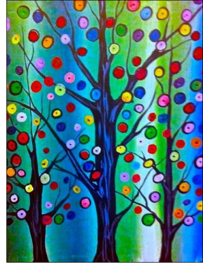
'Bubble Trees' is a lively study in exuberant colors